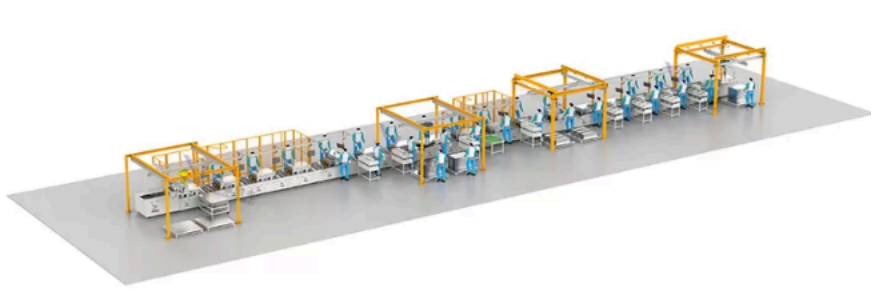
EV Prismatic Battery Module PACK...