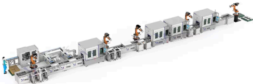
EV Cylindrical Battery Module PACK...