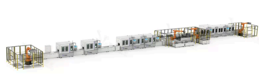
ESS Prismatic Battery Module PACK...

As the world transitions towards sustainable energy solutions, the demand for high-performance lithium battery packs continues to soar. At the heart of this burgeoning industry lies a meticulously orchestrated assembly process, where individual lithium-ion cells