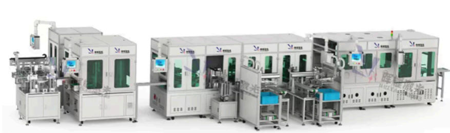
Prismatic Battery Cap Manufacture...