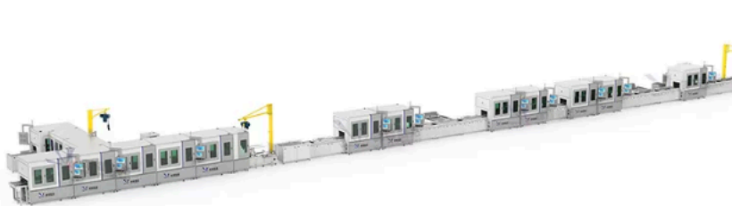
EV Pouch Battery Module PACK Line